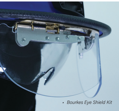
• Bourkes Eye Shield Kit